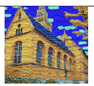
Draw admissible evidence in the style of Van Gogh