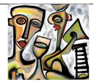
Draw inadmissible evidence in the style of Picasso

On the other hand, VALL-E, a model for text-to-speech ("TTS") synthesis focuses on the task of generating audio from a given text prompt and a "ground truth," an audio of the intended speaker that is at least three seconds in length.<sup>37</sup> Previously, TTS required clean data from a recording studio to produce output, meaning a lot of available data could not be used for training. This is no longer the case, as VALL-E now accepts a wide variety of training data and leverages it to make better generalizations. To the naked ear, the generated audio is indistinguishable from the original speaker because VALL-E accounts for background noise in addition to just matching the speaker's voice.