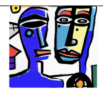
Draw admissible evidence in the style of Picasso