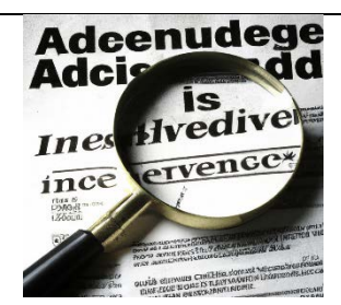
Draw admissible evidence